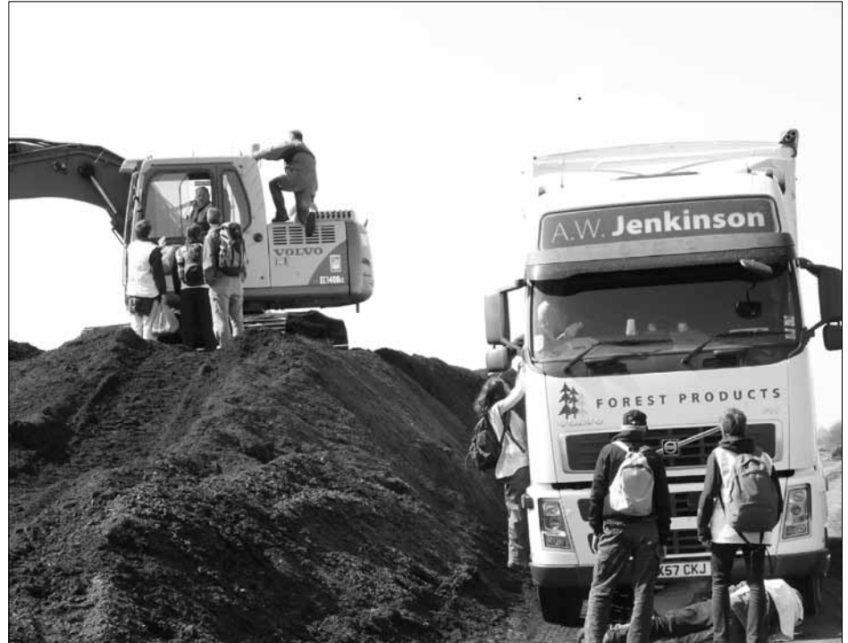
Workers at Chatmoss get bogged down by protestors

The destruction of peat bogs is not only a threat to local ecosystems but also massively contributes to climate change. Peat bogs act as huge 'carbon sponges': as peat is formed it locks away carbon that has been absorbed by plants as they grow, thereby helping to reduce the carbon in the atmosphere and slow global warming. The draining and extraction of this unique habitat causes the release of thousands of