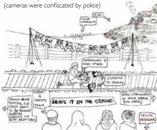
An artist's impression of the blockade (cameras were confiscated by police)

The activists reached the rail track at the mine at midday, and immediately phoned security to warn them about the protest. Three activists then used chains and padlocks to lock themselves to the train tracks. Two activists went to a nearby vantage point where they could warn any approaching trains. All of them were removed within four hours, but then a second wave of activists equipped with more heavy duty lock-on equipment attached themselves to the track, and took a further 4 hours to be removed.