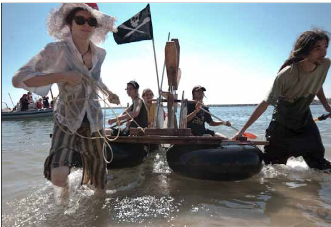
Shoring up the blockade at Newcastle Coalport, Australia

In early April Agenda 21 sabotaged a Norwegian whaling ship. Using the name of a 1992 United Nations Conference on the Environment, the group has promised Norway that if they did not comply with international conservation law, they would sink their whaling ships. This is the seventh Norwegian whaling vessel to come under attack since 1992. The head of a Norwegian whaling organisation complained "It is outrageous that this can be done year after year without anyone being caught."